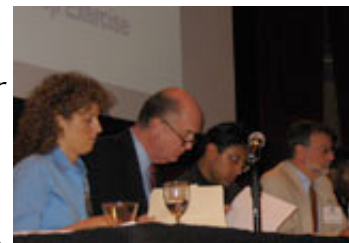
Tabletop Exercise Panel