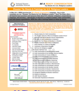
26 Tip Sheets For U.S. Religious Leaders